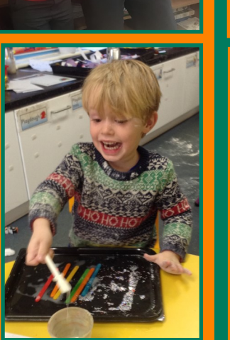
We had lots of fun AND raised money for Save the Children!